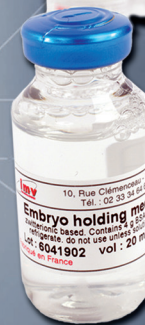
Embryo Holding and Shipping Medium (by 4 x 20 ml) ref 019449