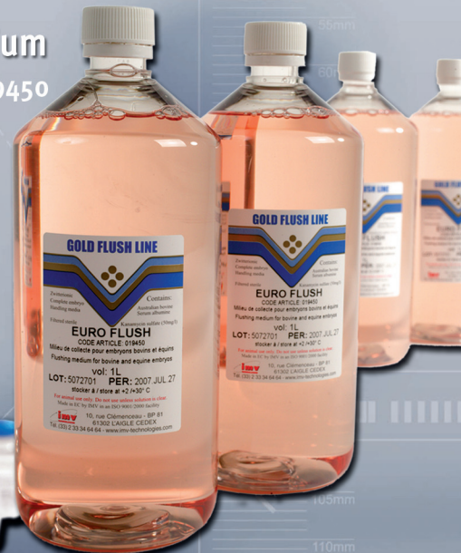
Euroflush Embryo Flushing Medium ref 019450