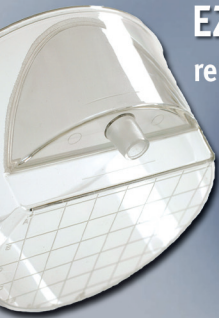
EZ Filter ref 017726