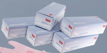
Red sensitive gloves Dispensing box - 100 gloves ref 021091