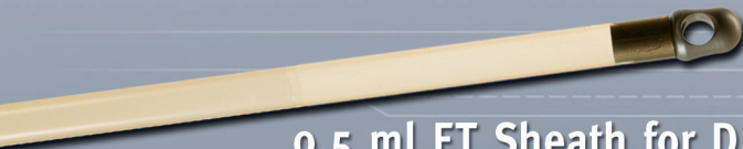
0.5 ml ET Sheath for D5-D8 Embryo Sterile - (Individually wrapped, by 10) ref 017532